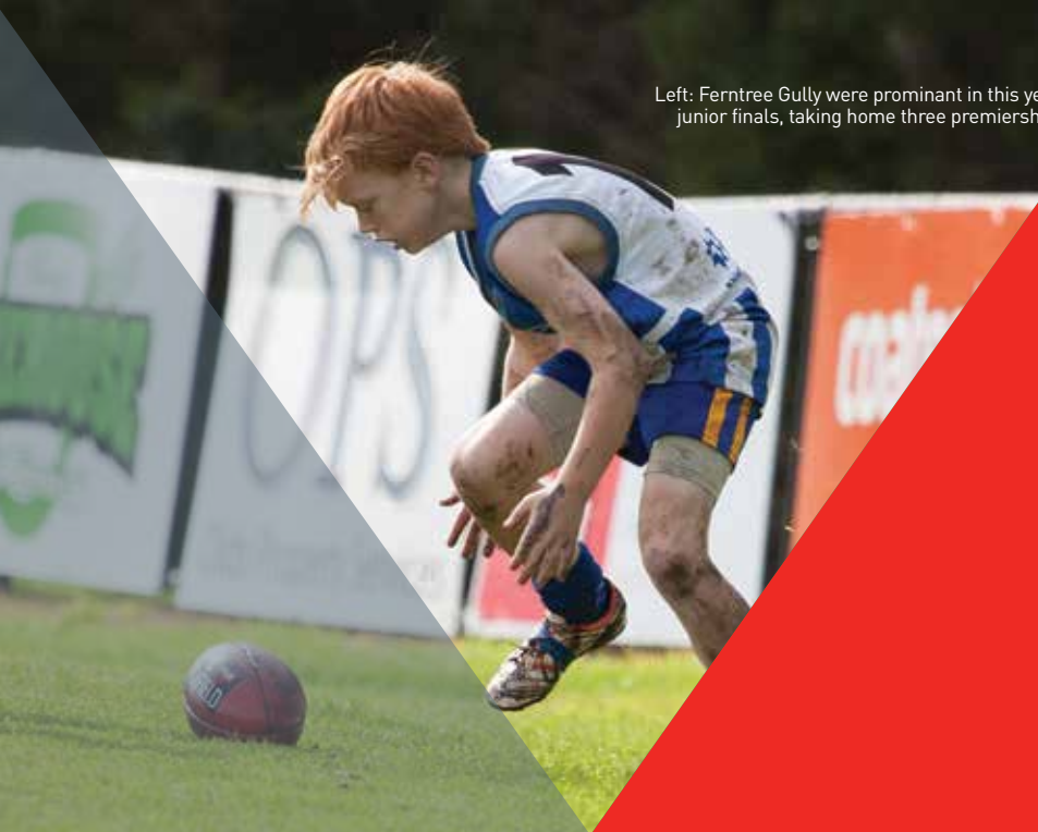
Left: Ferntree Gully were prominent in this years junior finals, taking home three premierships.