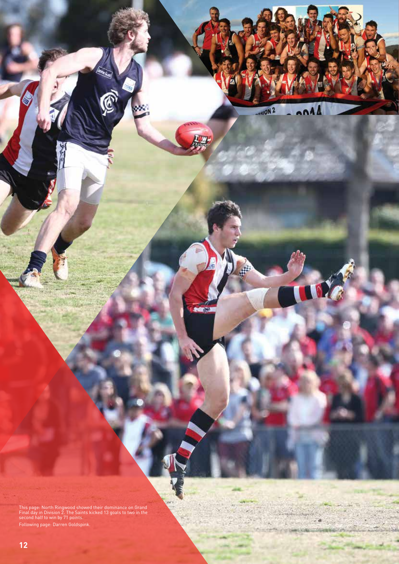
This page: North Ringwood showed their dominance on Grand Final day in Division 2. The Saints kicked 13 goals to two in the second half to win by 71 points. Following page: Darren Goldspink.